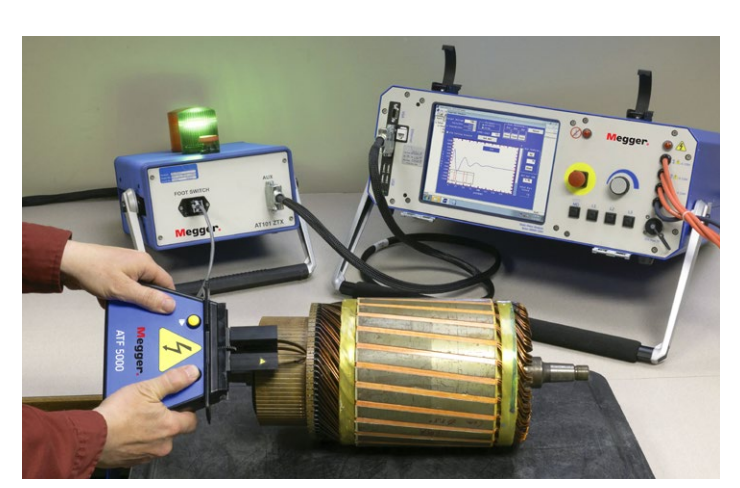
Testing an armature using the ZTX accessory and the ATF5000 commutator probe.