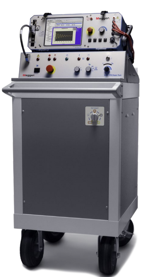
The AWA-IV combined with a PPX Power Pack

Bar-to-bar armature tests on low-impedance coils are possible with the use of the Baker ZTX bar-to-bar test accessory or Baker PP85 or PPX 30A power packs. The Baker ZTX accessory reduces the voltage applied while increasing current to enable accurate tests on DC motor armatures as well as other low-impedance windings. The ATF 5000, a hand-held device that comes with the Baker ZTX , improves the speed, accuracy and ease of testing armatures bar-to-bar.