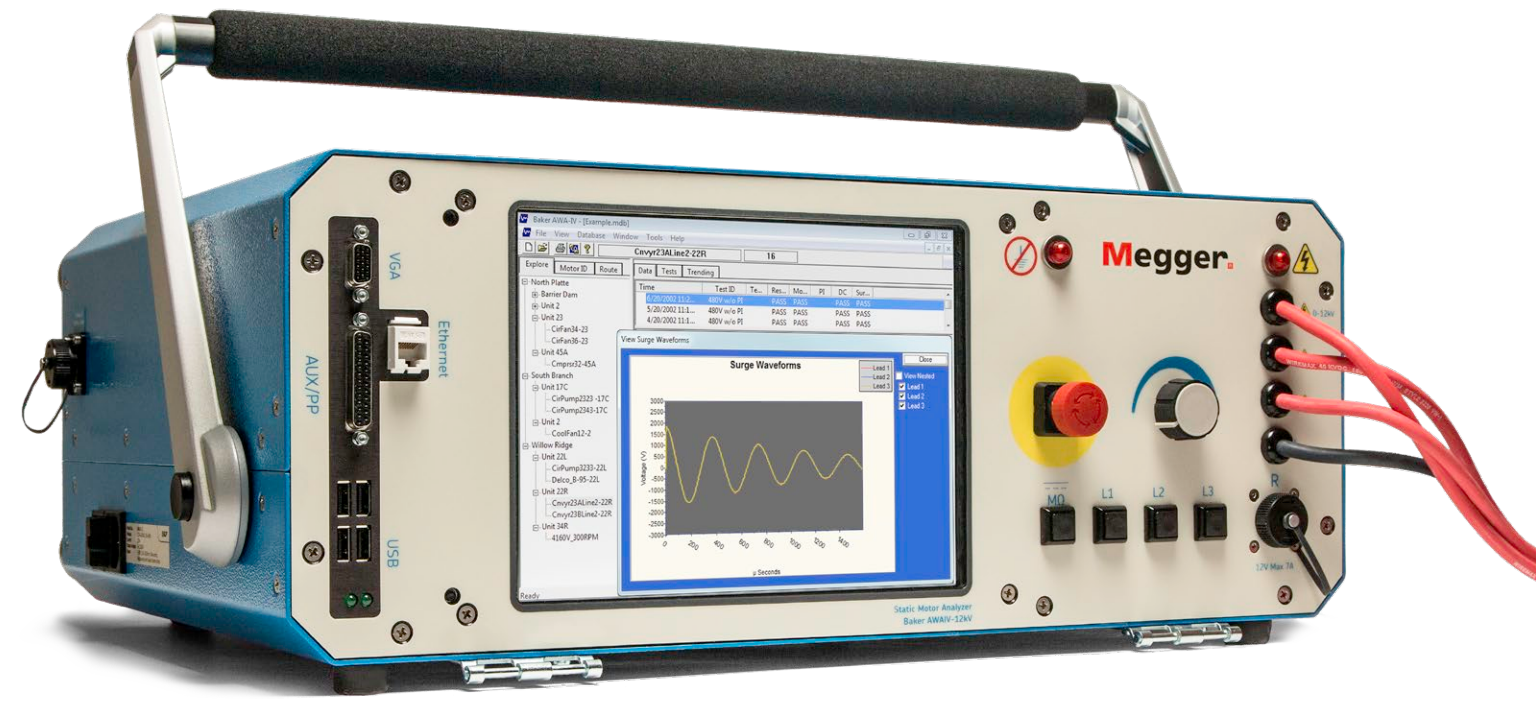
The Baker AWA-IV 12kV analyzer. The 6kV and 12kV HO (high output) models share this form factor.